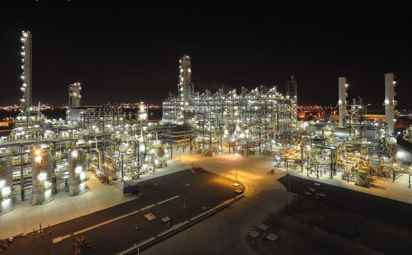
Borouge 2, world's largest ethane cracker

Another important down stream process is the production of linear alpha olefins, used as copolymers and for the production of alpha alcohols, synthetic lubricants, etc. with an increasing economic importance. Since many years, Linde has supplied plants for the recovery of these hydrocarbons and since a few years Linde has offered the complete plants, based on the new alpha-SABLIN® process, developed in cooperation with Sabic. The first large scale plant with a capacity of 150,000 mta alpha olefins went on-stream in 2006 operated by United in Al Jubail/Saudi Arabia.