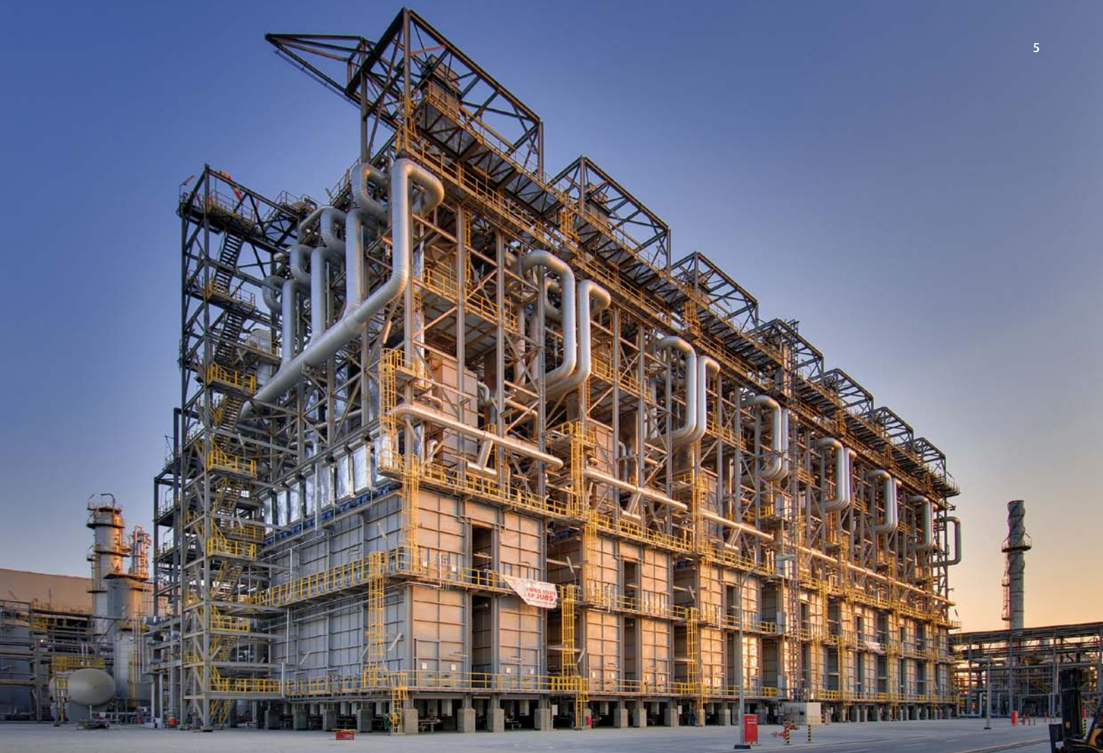
Furnaces in an ethylene plant in Saudi Arabia