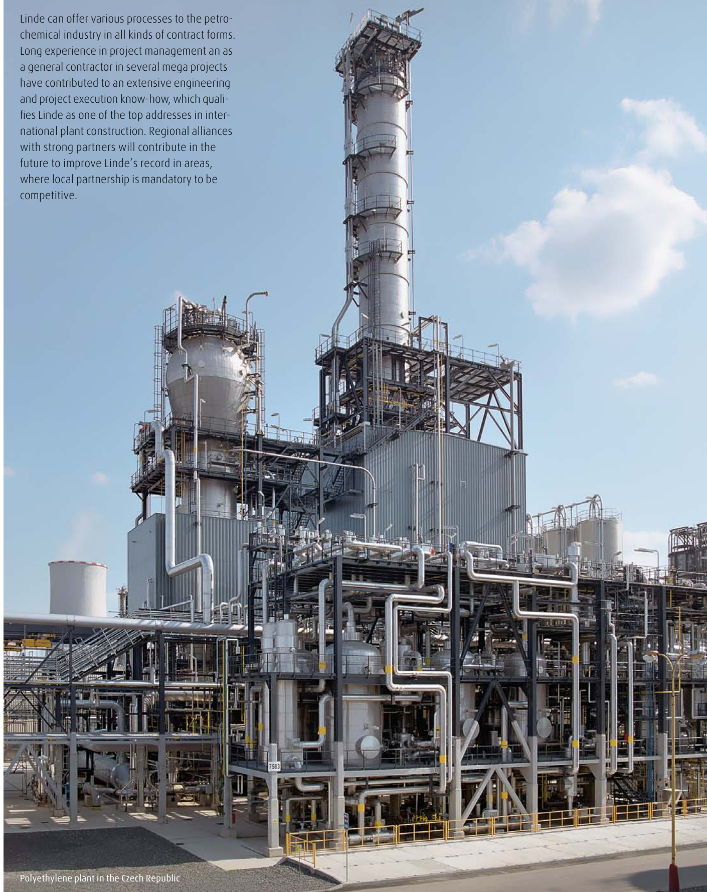
Polyethylene plant in the Czech Republic

Linde can offer various processes to the petrochemical industry in all kinds of contract forms. Long experience in project management and as a general contractor in several mega projects have contributed to an extensive engineering and project execution know-how, which qualifies Linde as one of the top addresses in international plant construction. Regional alliances with strong partners will contribute in the future to improve Linde's record in areas, where local partnership is mandatory to be competitive.