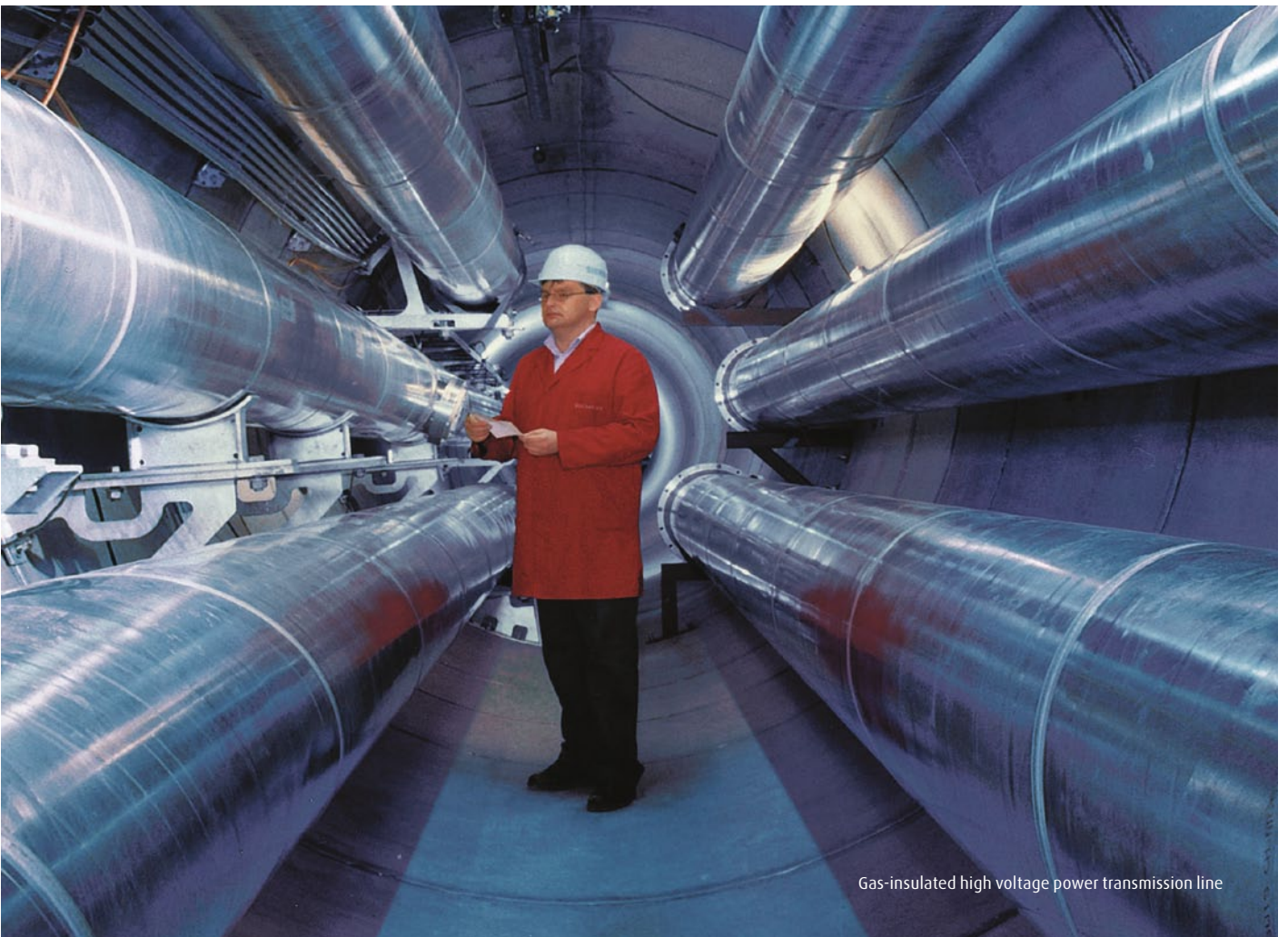
Gas-insulated high voltage power transmission line