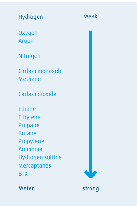
Figure 1: Ranking of adsorption forces