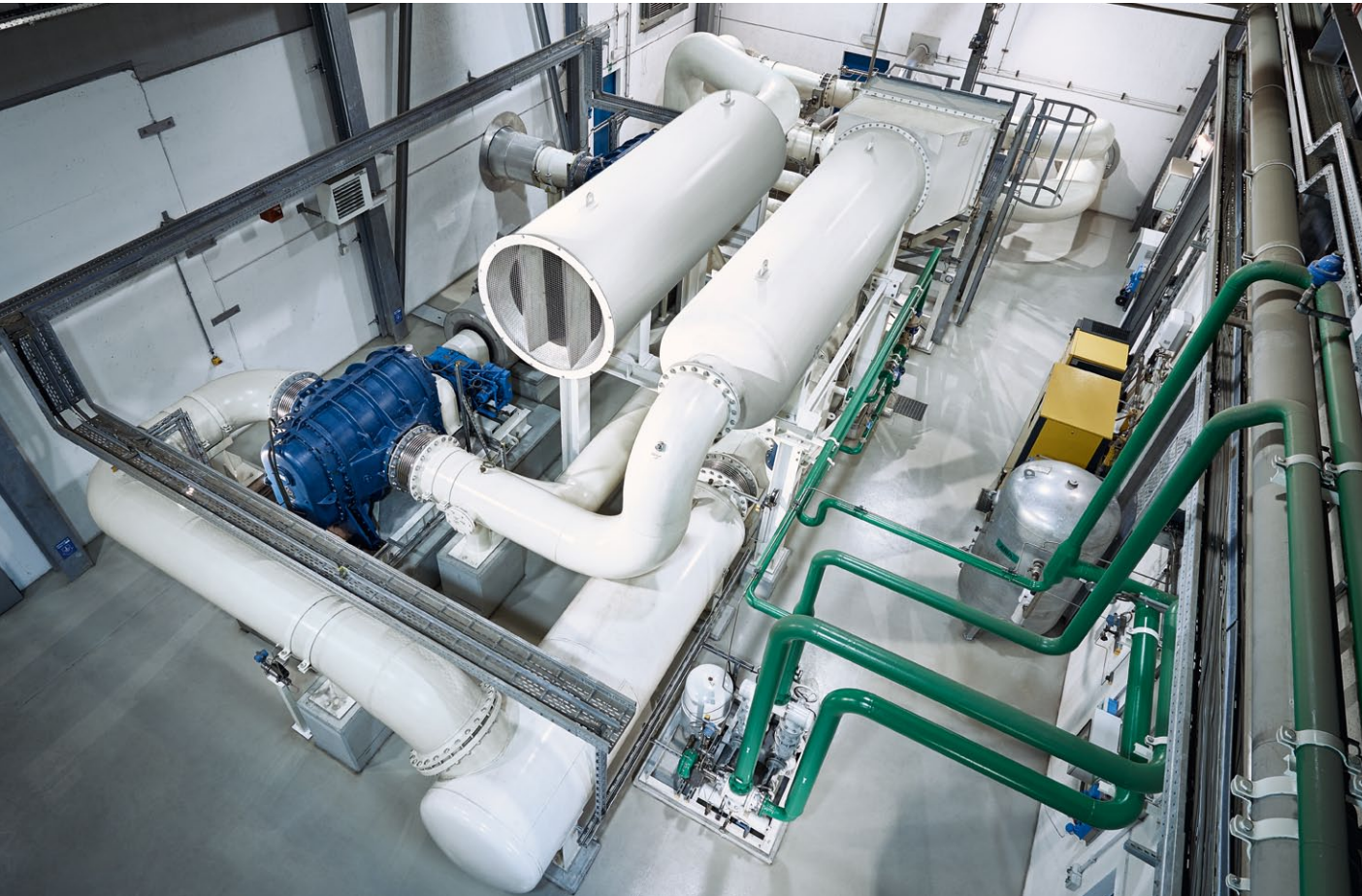
VPSA plant for 2400 Nm 3 /h (82 tpd) oxygen product for steel plant in Italy.