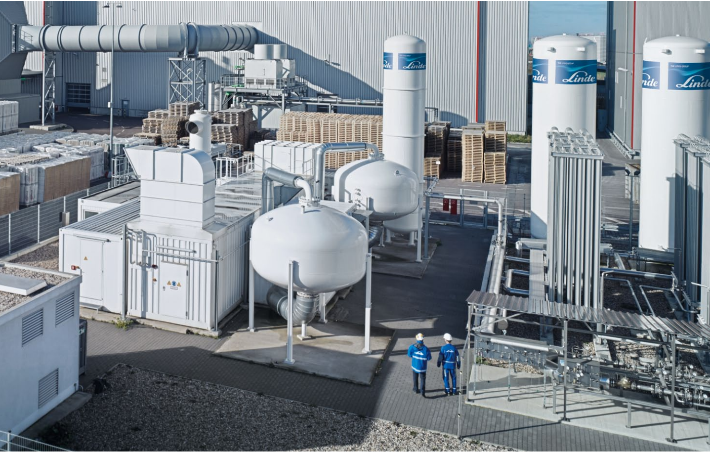
Containerised VPSA plant including backup system for 1,500Nm 3 /h (51 tpd) oxygen for glasswool plant in Germany.