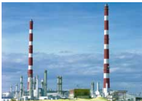
Sulfur recovery plants have increased capacity through oxygen enrichment.