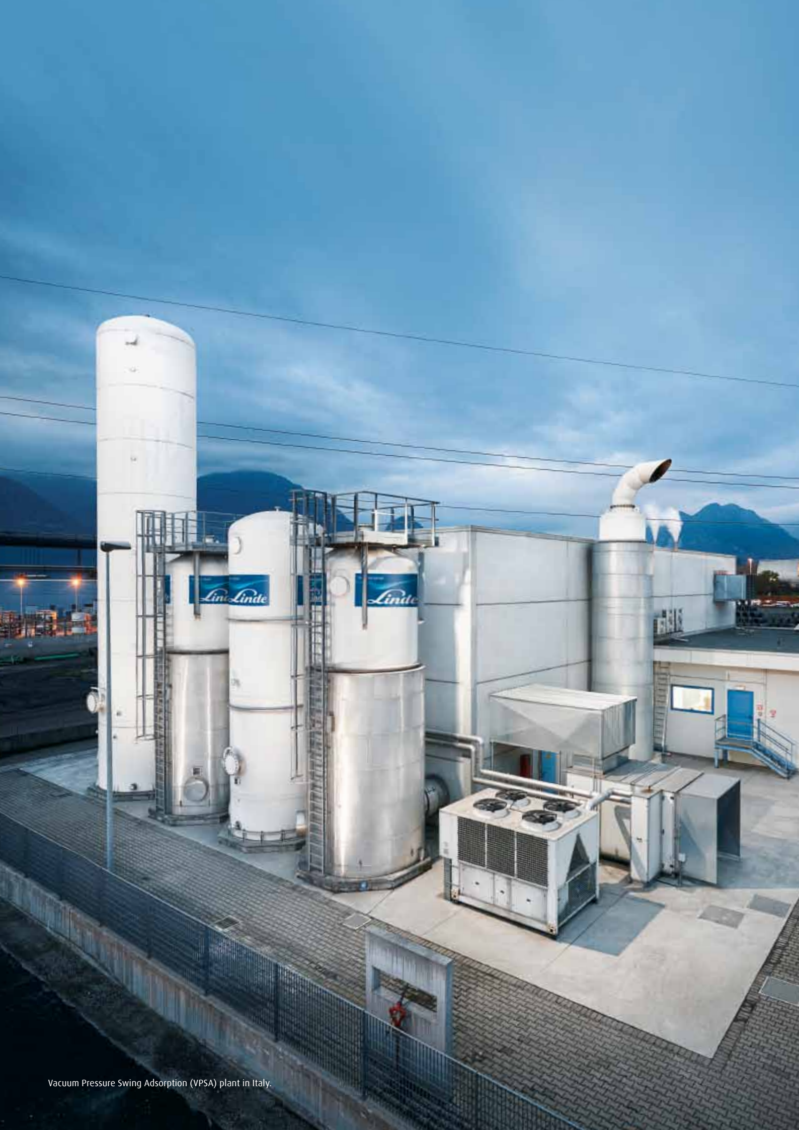
Vacuum Pressure Swing Adsorption (VPSA) plant in Italy.