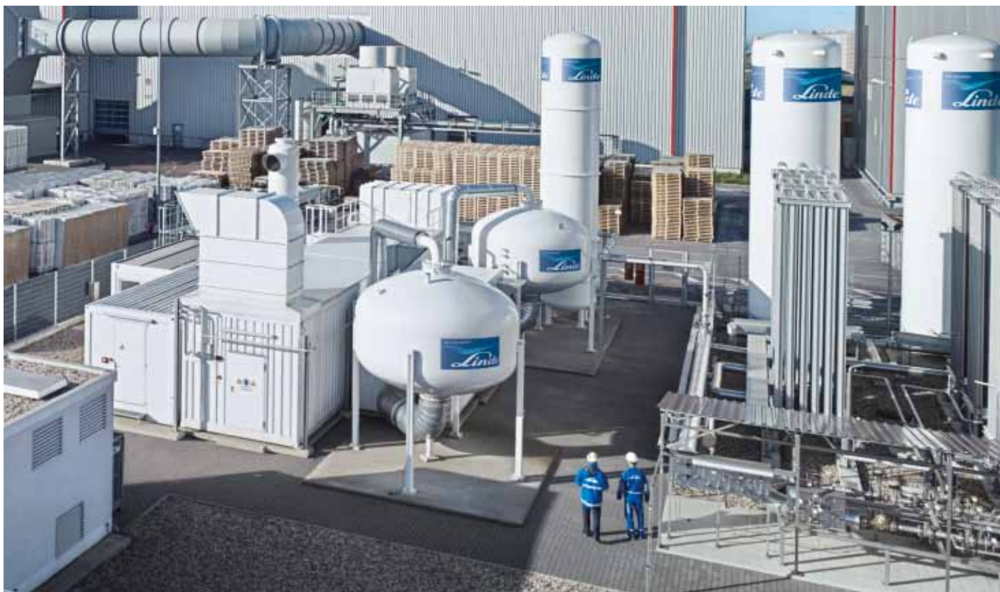
Containerised VPSA plant including backup system for 1,500Nm 3 /h (51 tpd) oxygen for glasswool plant in Germany.