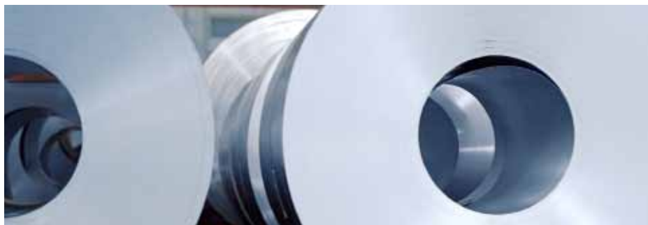
The steelmaking process requires oxygen.