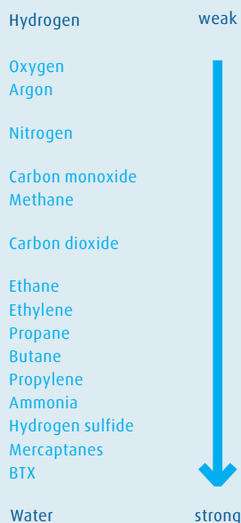
Figure 1: Ranking of adsorption forces