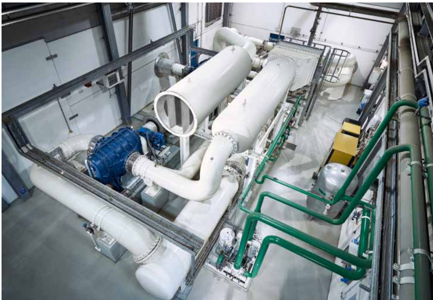
VPSA plant for 2,400 Nm 3 /h (82 tpd) oxygen product for steel plant in Italy.