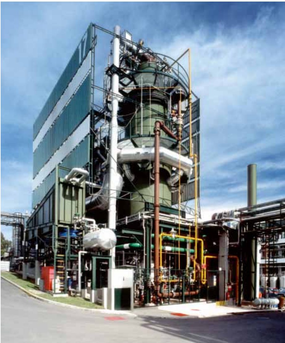
Thermal oxidation unit for aqueous waste, pharmaceutical industry, Portugal.

+60 Years of experience all over the world.