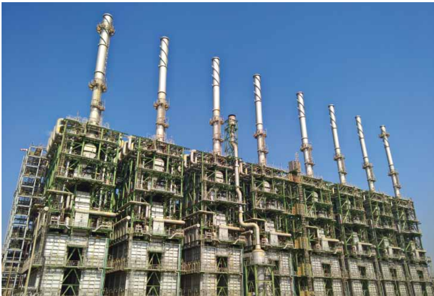
Cracking furnaces, Dahej, India.