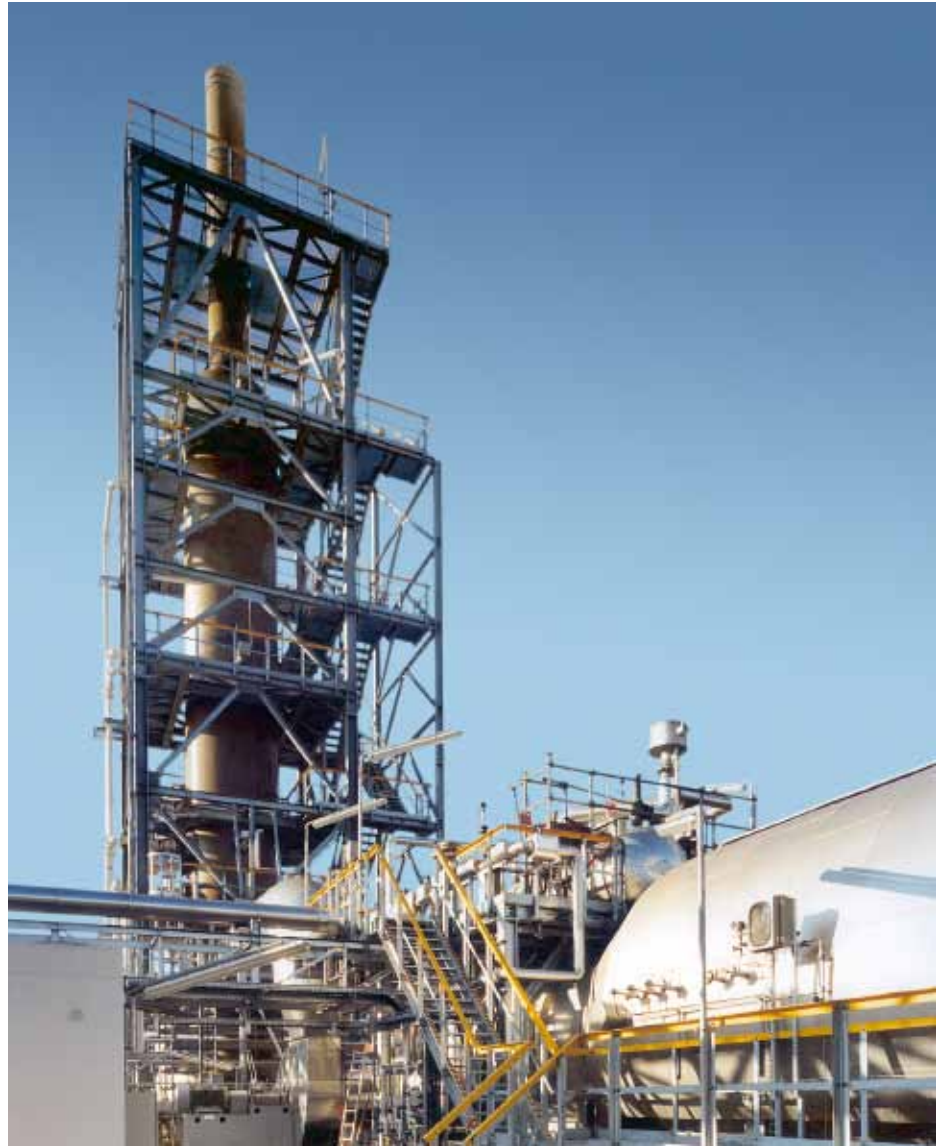
Thermal oxidation unit for organic and aqueous waste liquid, Böhlen, Germany.

99.99% destruction efficiency guaranteed