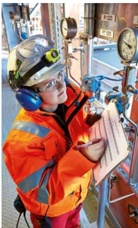
Working on site.