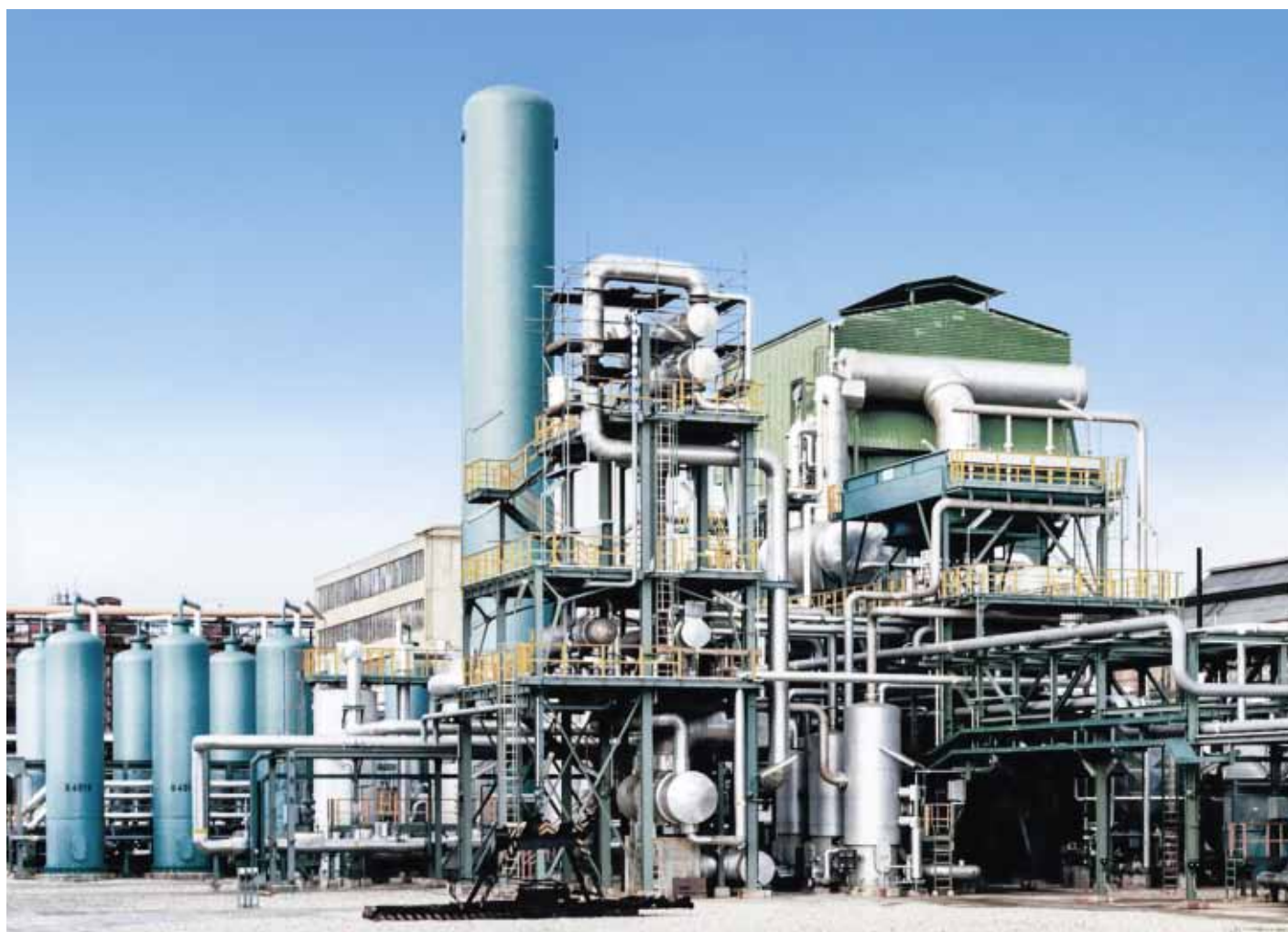
Steam reformer, Linde AG, Leuna, Germany.

Designing and building steam reformers since 1957