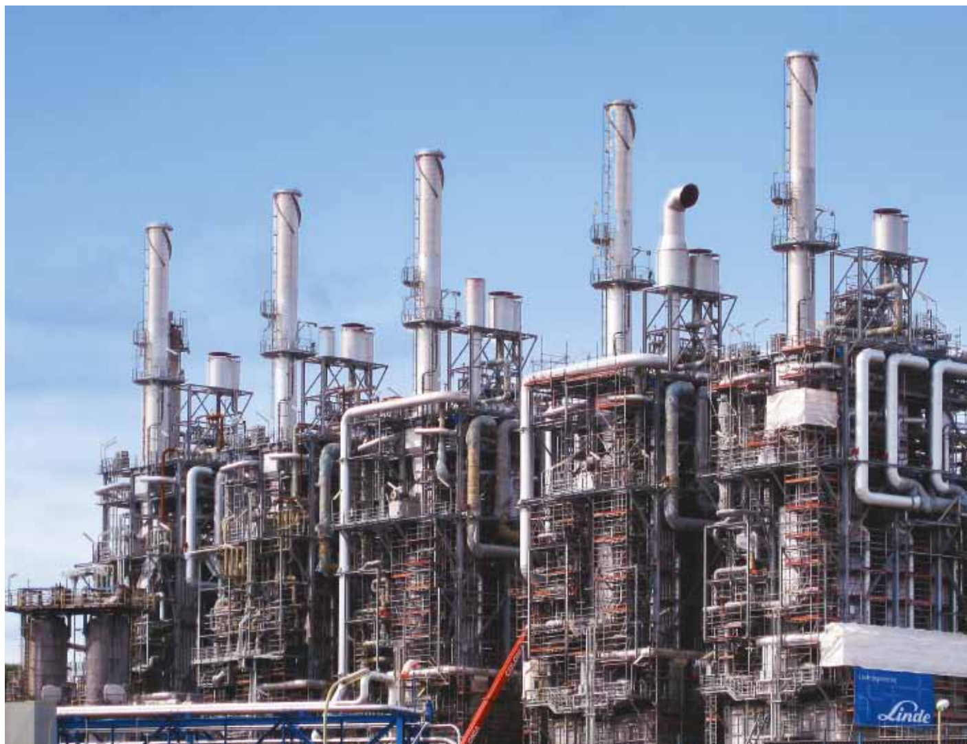
Furnace group in Gofer, Germany.

Over 92% furnace efficiency rates achieved