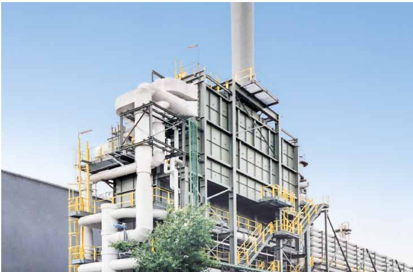
EDC cracking furnace DOW-BSL, Schkopau, Germany.