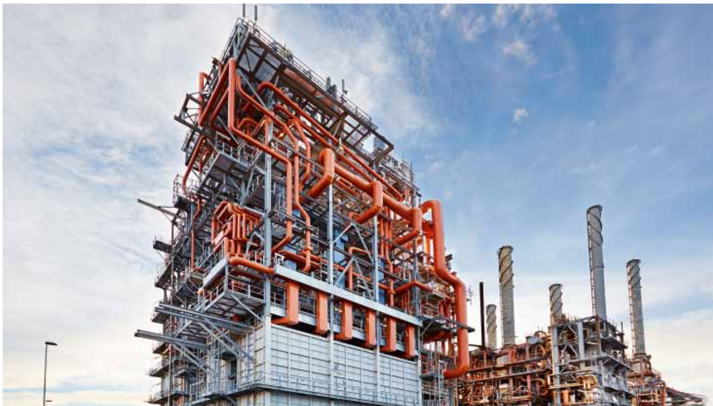
Cracking furnace, Rafnes Norway, Noretyl AS.