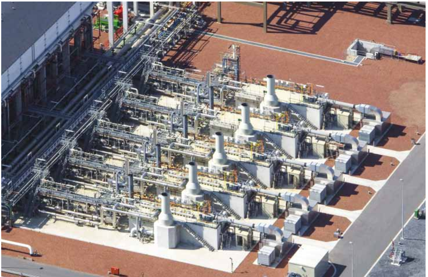
LNG vaporisers, Belgium.