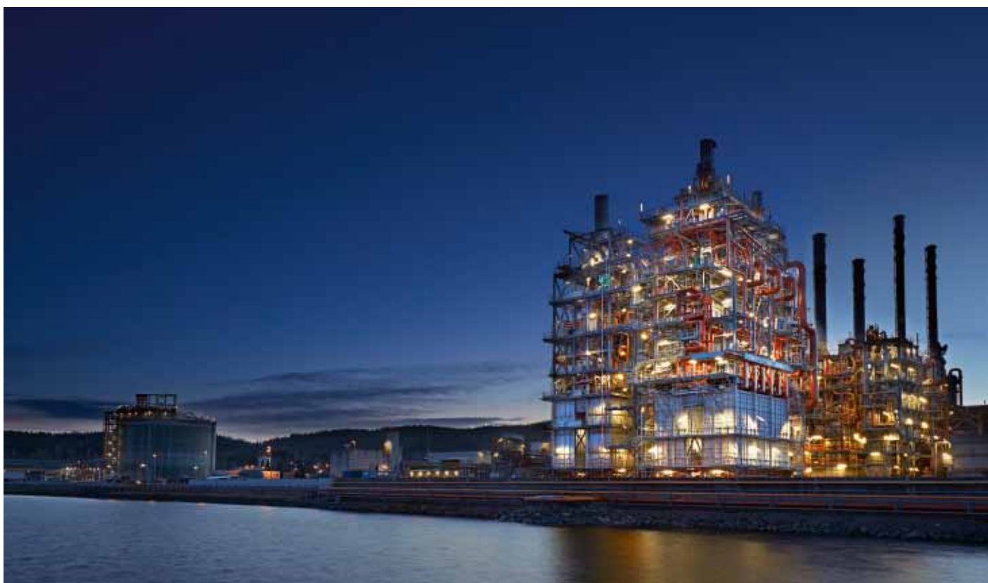
Cracking furnace for ethylene production, Rafnes Norway, Noretyl AS.

In 1985, Linde AG became the sole owner of Selas-Kirchner, Germany and of the process furnaces division of Selas Corporation. This division now operates under the name Selas Linde North America based in Blue Bell, Pennsylvania, USA. On 1 January 1999, Selas-Kirchner GmbH was renamed Selas-Linde GmbH. Selas-Linde GmbH and Selas Fluid Processing Corporation now market the entire, bundled know-how of Selas, Kirchner and Linde furnace technology know-how exclusively throughout the world under the Selas trademark. Since its acquisition of T-Thermal in 1992, Selas-Linde now complements its environmental engineering technology with extensive know-how and leading technology in the thermal oxidation of gaseous and liquid waste. Furthermore, Selas-Linde designs, supplies and constructs plants for the vaporisation of cryogenic liquids. Today, Selas-Linde is one of the leading global contractors in all of the above-mentioned fields.