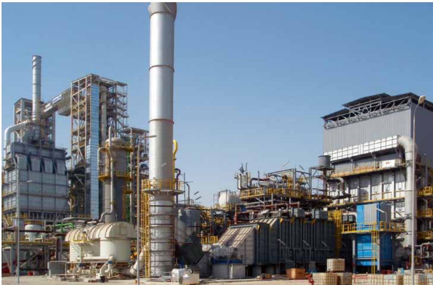
Reduction gas heater and reformer plant (HYL, Danieli), Abu Dhabi, UAE.