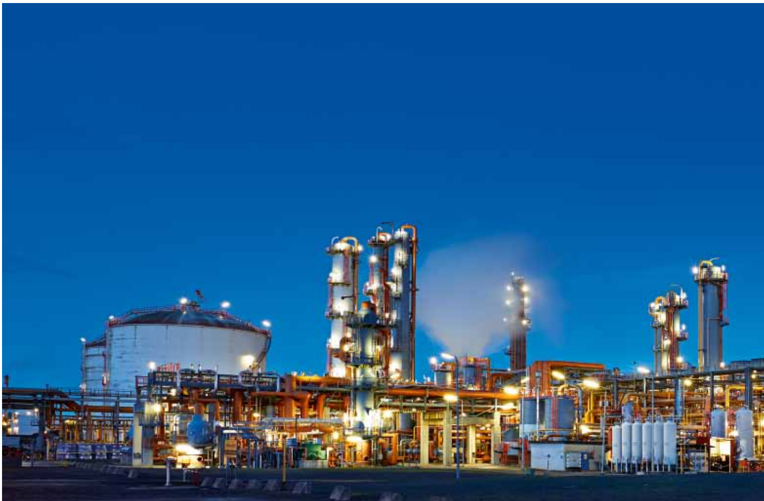
Petrochemical Plant, Rafnes, Norway.

These units are designed to meet the new regulatory standards with very low NOx emission values.