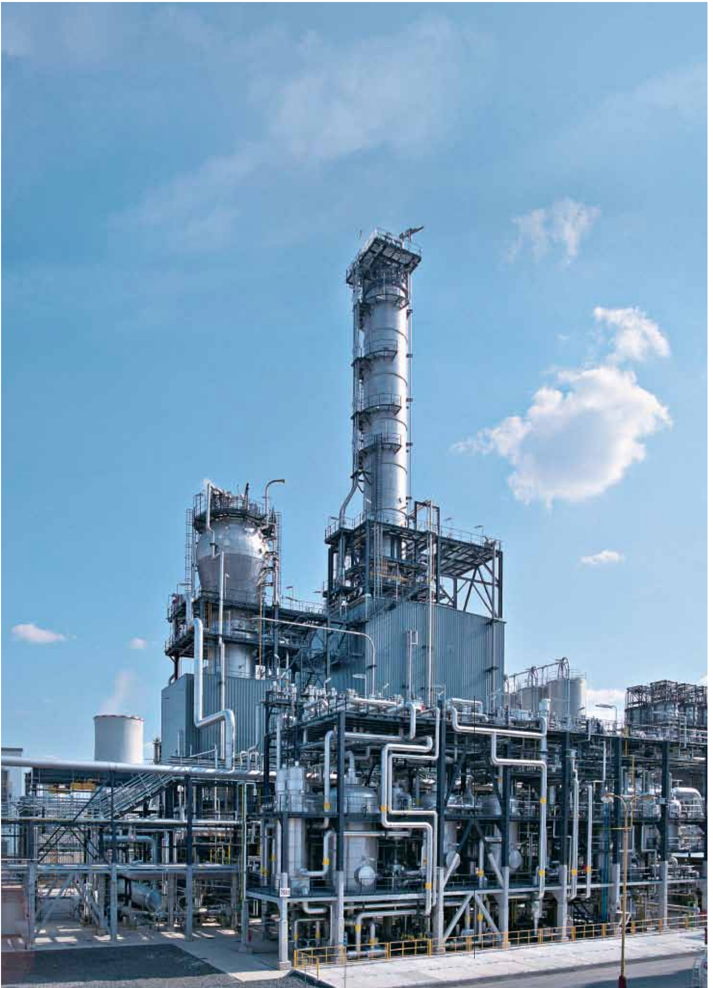
UNIPOL™ PE plant in Litvinov, Czech Republic.