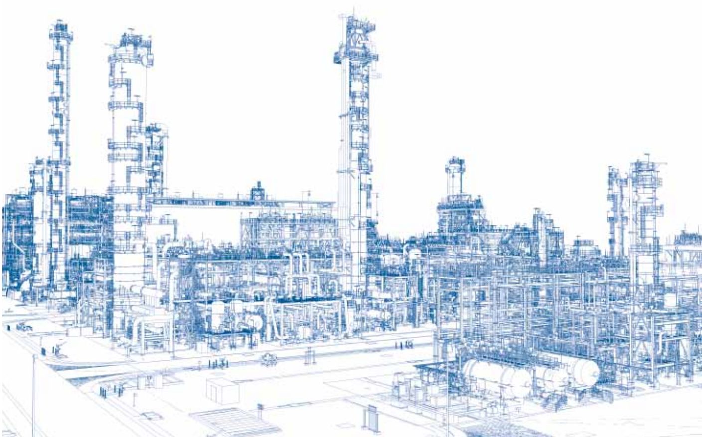
Borouge 2, Linde has built world's largest ethane cracker with a capacity of 1.45 million MTA of ethylene.