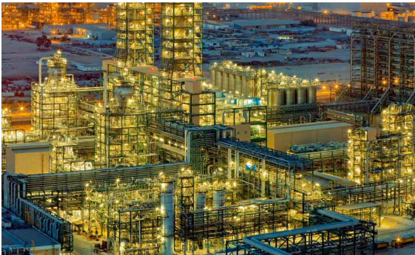
UNIPOL™ PE plant in Al-Jubail Industrial City, Saudi Arabia