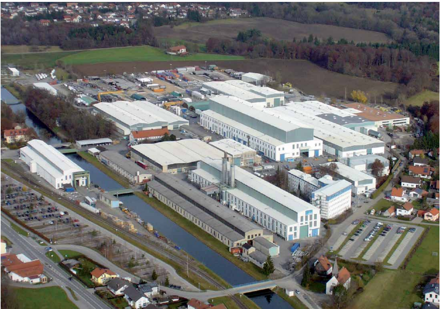
Schalchen plant, approx. 100 km east of Munich, Germany