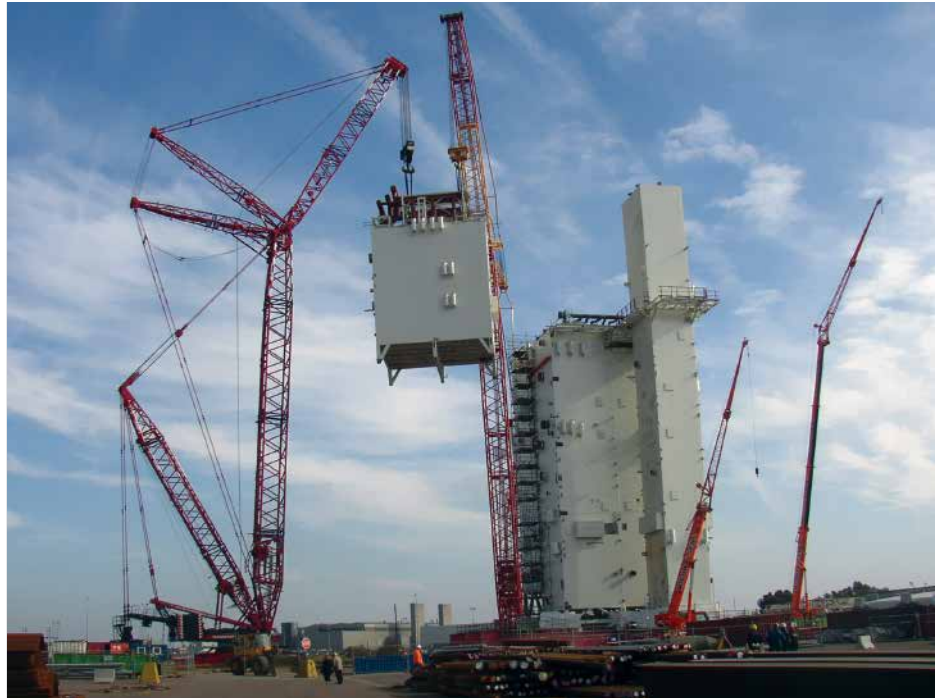
Cold box assembly for the Snøhvit LNG plant in Norway at the satellite workshop port of Antwerp, Belgium

For very large units satellite workshops are available at the North Sea coast (e.g. Bremen/Germany and Antwerp/Belgium).