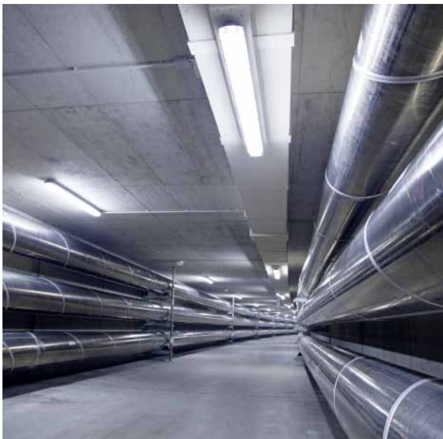
Gas-insulated high voltage power transmission line.

Read more: linde-engineering.com/plantcomponents