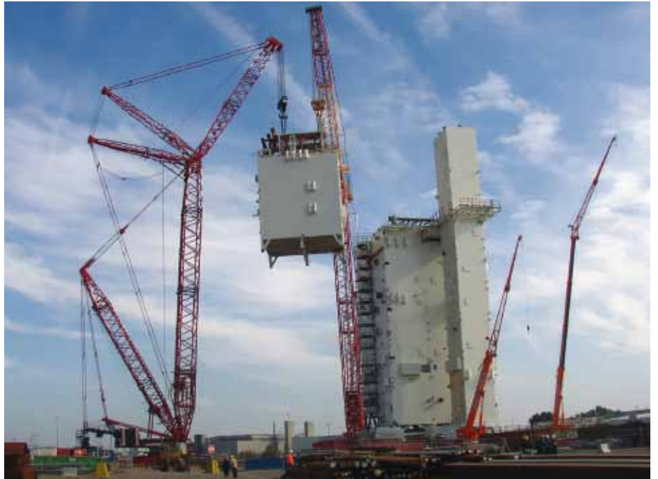
Cold box assembly for the Snøhvit LNG plant in Norway at the satellite workshop port of Antwerp, Belgium.

For very large units satellite workshops are available at the North Sea coast (e.g. Bremen/Germany and Antwerp/Belgium).