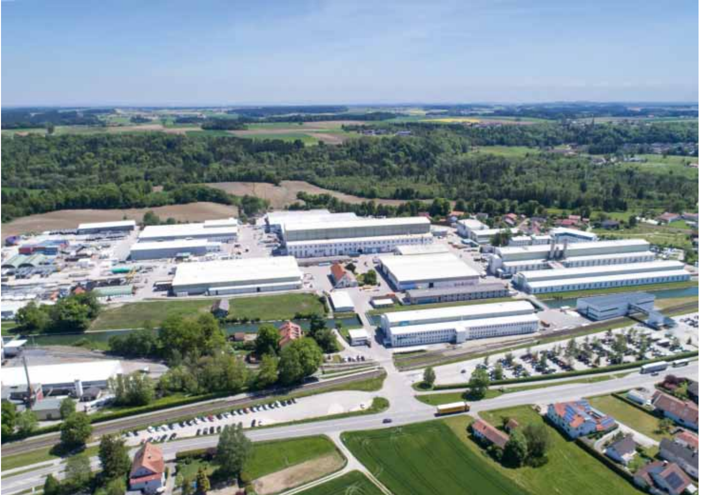
Schalchen plant, approx. 100 km east of Munich, Germany.