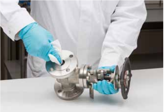
Wipe test of an oxygen valve

Discover how we can contribute to your success at www.linde-engineering.com