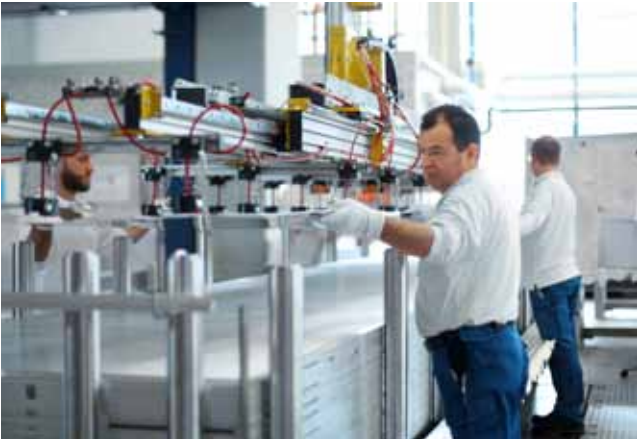
Assembly of cleaned parts for manufacturing of brazed aluminium plate-fin heat exchangers at Linde's own workshop

Linde is one of the largest and most experienced suppliers of air separation plants in the world. We have already delivered over 3,000 cryogenic air separation plants around the globe and operate more than 400 air separation plants ourselves. Furthermore, we design and manufacture all key cryogenic components at our own fabrication workshops. This experience gives us deep insights into the safe handling of oxygen equipment and our clients' needs in this area.