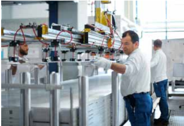
Assembly of cleaned parts for manufacturing of brazed aluminium plate-fin heat exchangers at Linde's own workshop

Linde is one of the largest and most experienced suppliers of air separation plants in the world. We have already delivered over 3,000 cryogenic air separation plants around the globe and operate more than 400 air separation plants ourselves. Furthermore, we design and manufacture all key cryogenic components at our own fabrication workshops. This experience gives us deep insights into the safe handling of oxygen equipment and our clients' needs in this area.