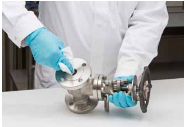
Wipe test of an oxygen valve

Discover how we can contribute to your success at www.linde-engineering.com